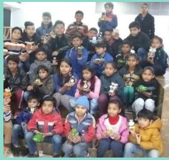
Winter Cloth Distribution @CEHRO INDIA: Donated winter clothes to 250 children of CEHRO INDIA with the help of Responsenet, our food partner.