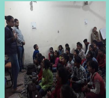
World Environment Day 2019