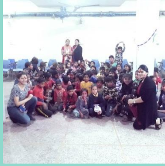
Children's Day Celebration