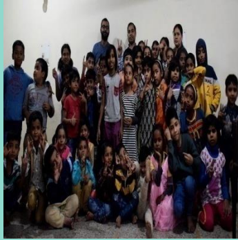
Chritmas Celebration @ CEHRO INDIA