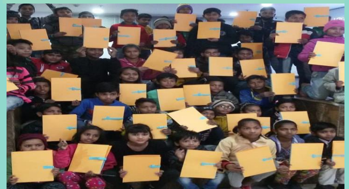
Designing Corrugated Animals Workshop: A totally different and interesting art form which children learned in one of their session @Kiran Nadar, Museum of Art.