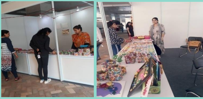
Stall Exhibition "Quilling Art By CEHRO INDIA" @ ESRI INDIA: Wonderful opportunity to put up a stall for the greater cause "Help needy children to light a lamp on Diwali and their Education".