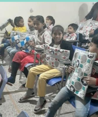
Bag Distribution Drive: School bags were distributed to children of CEHRO INDIA by Akshar Foundation.